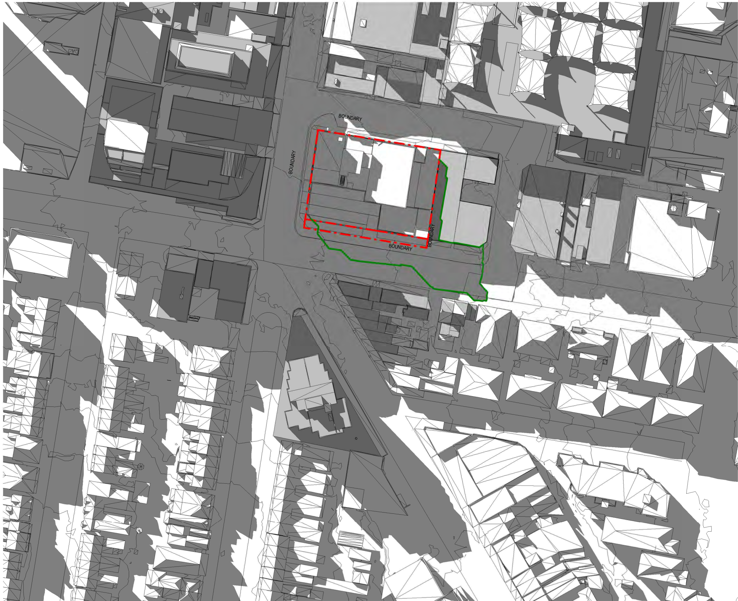
1 SOLAR ANALYSIS - 1PM - EXISTING 1 : 1000