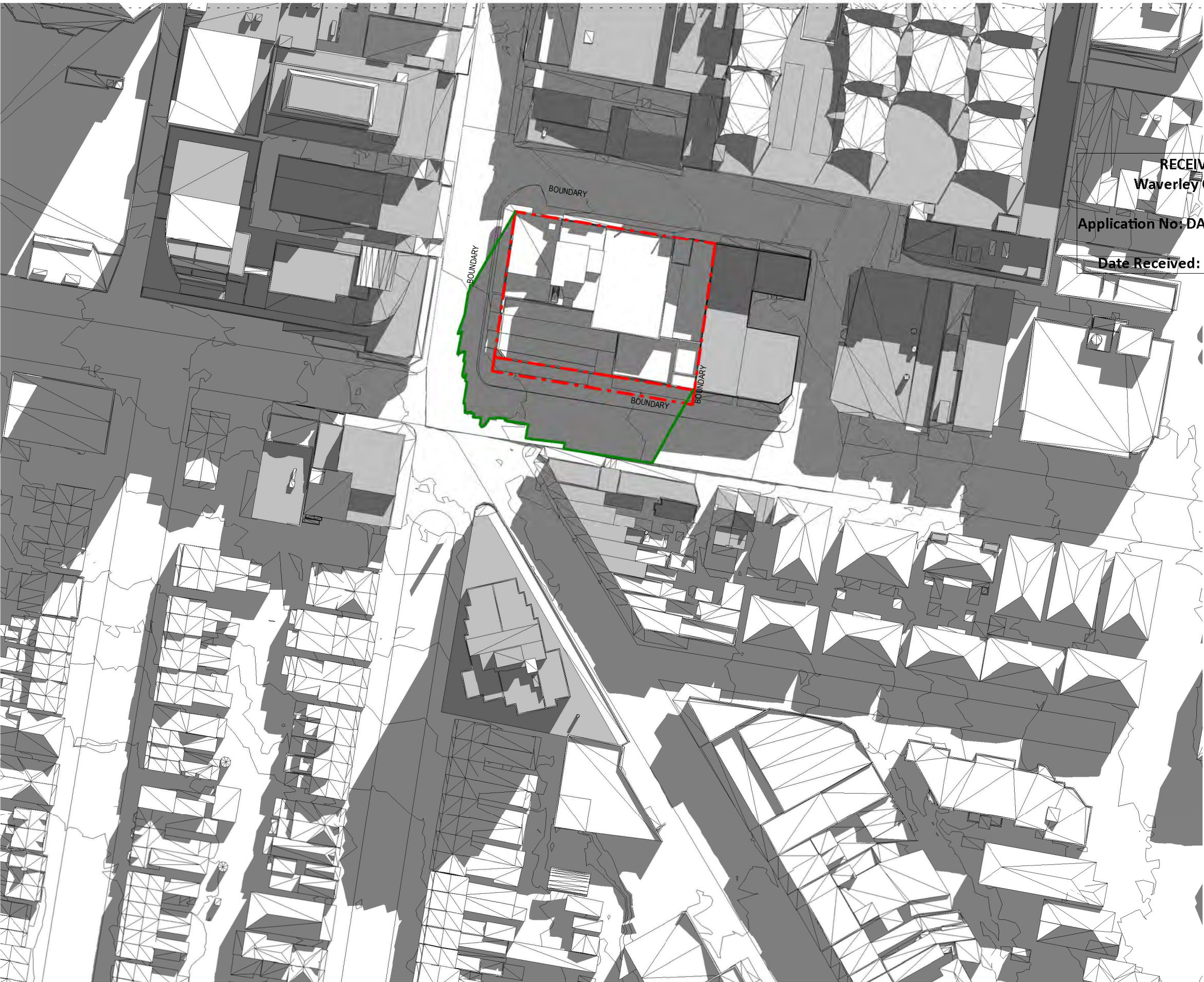
1 SOLAR ANALYSIS - 9AM - EXISTING 1:1000