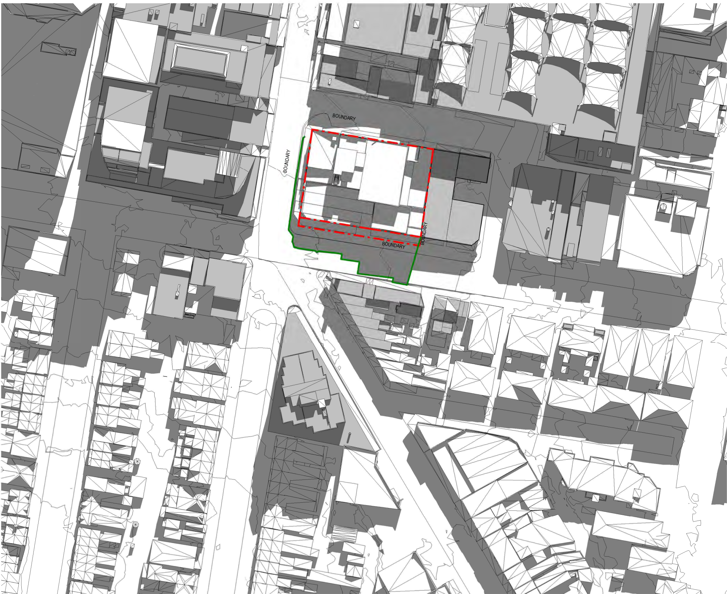
3 SOLAR ANALYSIS - 11AM - EXISTING 1:1000