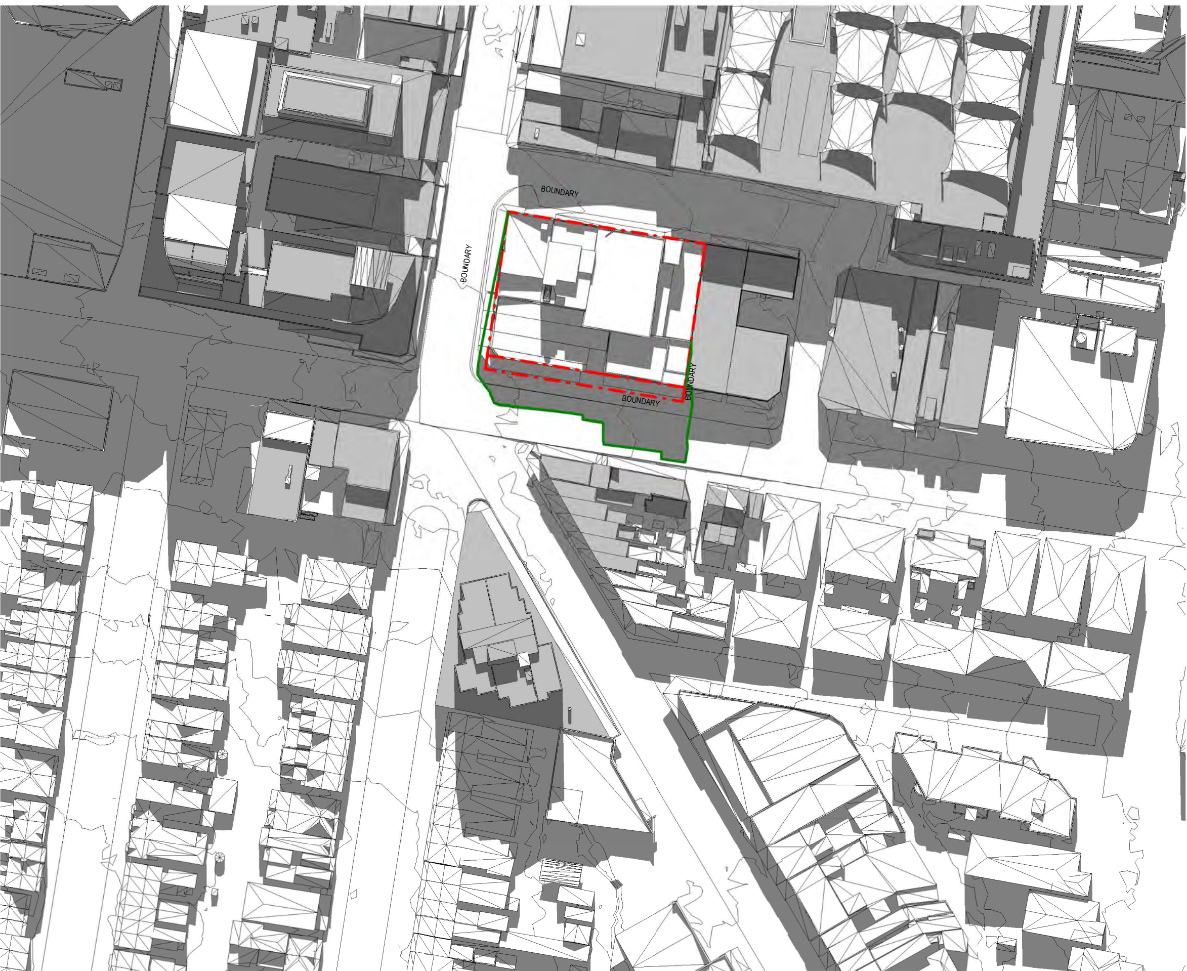
4 SOLAR ANALYSIS - 12PM - EXISTING 1:1000